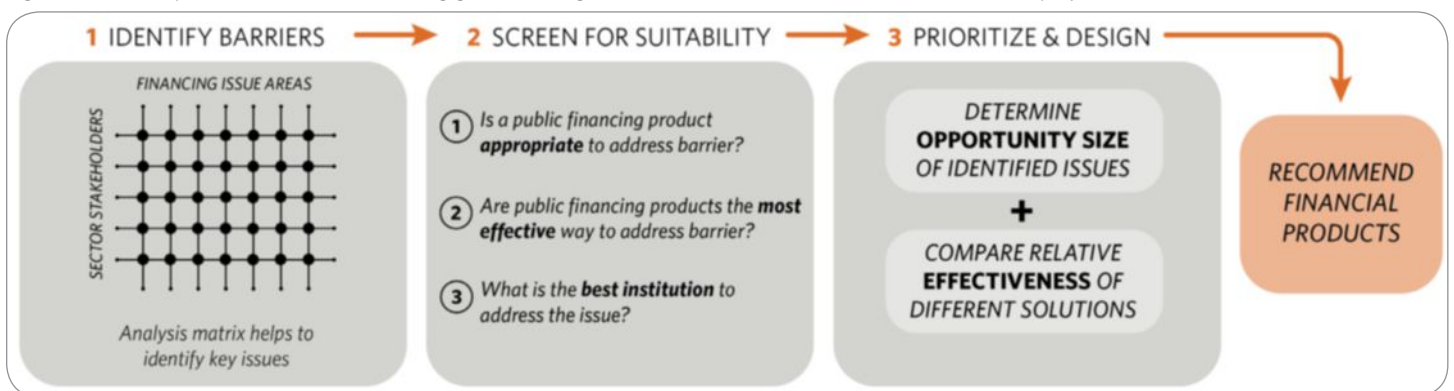
Figure 1: CPI’s analysis framework for evaluating green banking and other financial interventions for low-carbon projects.

This brief follows the sequence laid out in Figure 1. We begin, in section 2 , by identifying significant financial barriers to a low-carbon economy. In section 3 , we then assess the suitability of public financing interventions to address these barriers and consider whether a green bank or other public financial institution is the most sensible institution to intervene. Finally, we identify the most effective form of policy intervention as outlined in section 4 . Appendix 1 provides more detail on the matrix that forms the basis of section 2.