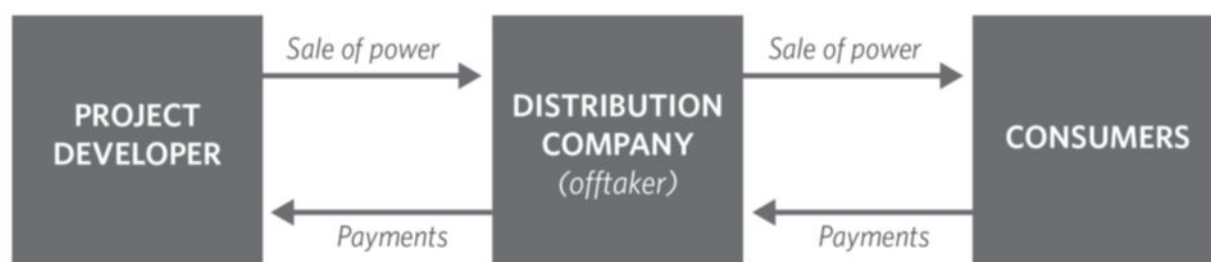
Figure 1: Cash flows in a renewable energy project

The ability of an off-taker to make payments depends on its credit worthiness. In India, the majority of off-takers are state-level public sector electricity distribution companies (DISCOMs). Most DISCOMs in India are in a poor financial state. State-level DISCOMs, with collective debt of INR 3.04 trillion and losses of INR 2.52 trillion, are on the brink of financial collapse (Livemint, 2014).