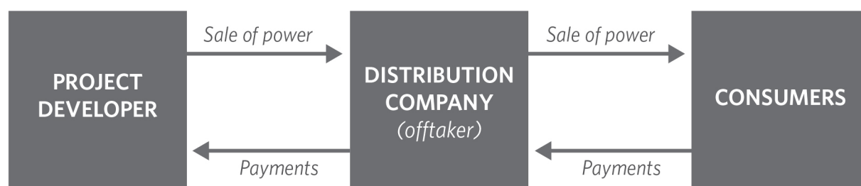
Figure 1: Cash flows in a renewable energy project

The ability of an off-taker to make payments depends on its credit worthiness. In India, the majority of off-takers are state-level public sector electricity distribution companies (DISCOMs). Most DISCOMs in India are in a poor financial state. State-level DISCOMs, with collective debt of INR 3.04 trillion and losses of INR 2.52 trillion, are on the brink of financial collapse (Livemint, 2014).